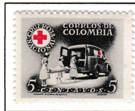
Nurse with Patient and Ambulance